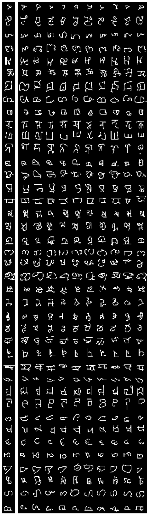
Figure 2: One-shot generation from our model. Left: Data from the Omniglot test set. Right: 10 Samples from our model of these newly seen classes. Each row corresponds to a different character.