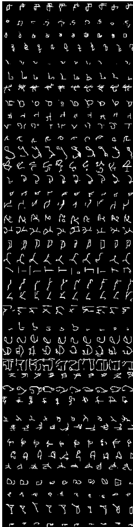
Figure 1: Zero-shot generation from our model. In each row we sample \eta \sim p(\eta) , then z_i \sim p(z|\eta) and x_i \sim p(x|z_i) . Each row contains examples of a different imagined class.